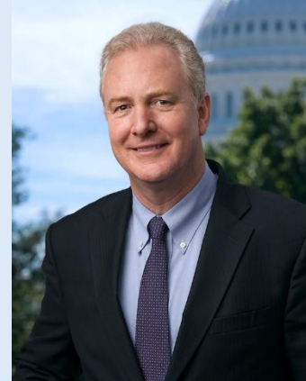
The Honorable Chris Van Hollen