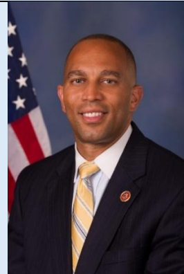
The Honorable Hakeem Jeffries Congressman, NY-08, Brooklyn, NY House Democratic Leader Most Dedicated and Distinguished Congressman to Fight for Our Democracy and Uphold the U.S. Constitution